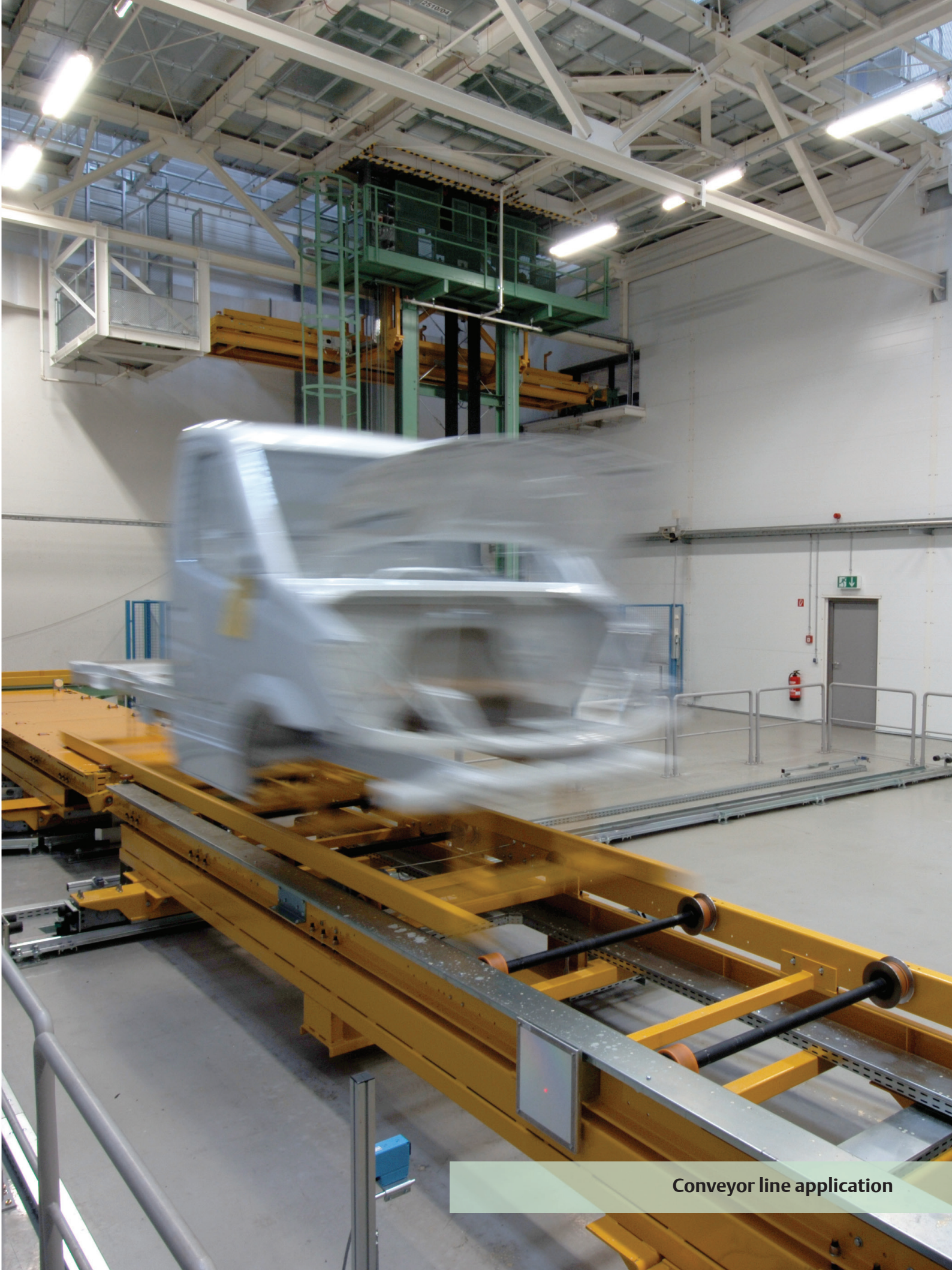
Conveyor line application