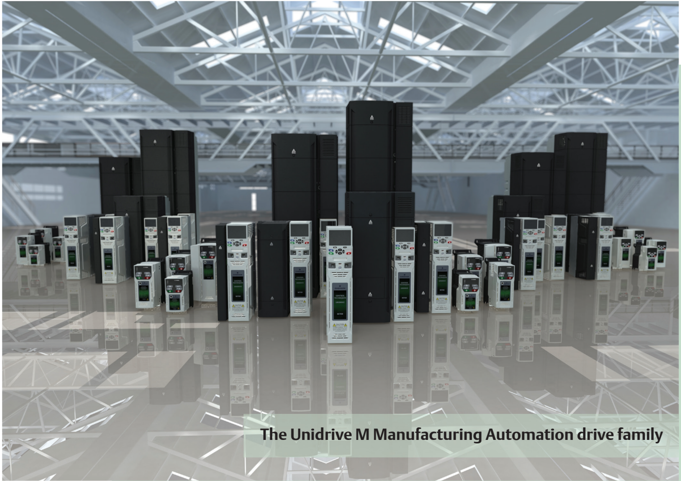
The Unidrive M Manufacturing Automation drive family